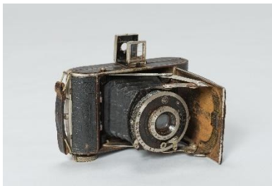
3. Uehara Yoshiharu’s Favorite Camera