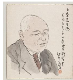
2. Portrait of Uehara Toratarō by Ishii Hakutei