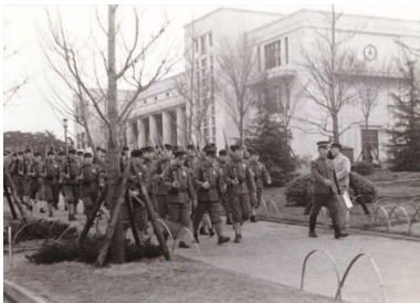
2. Preparatory students from Hiyoshi leaving for field exercises