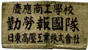
5. Armband for mobilized worker