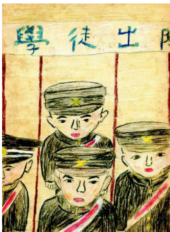
3. Students Go to Battle , an imon-ga (drawing to boost morale) by a Yochisha Primary School student