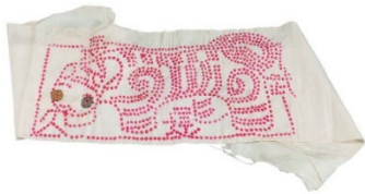
6. Senninbari (thousand stitch belt)