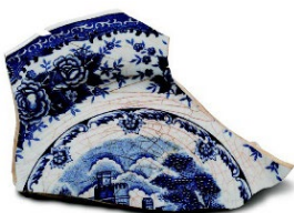
9. Object discovered from the Hiyoshi-dai underground bunker (piece of Western tableware)