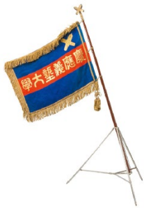
1. Keio University flag