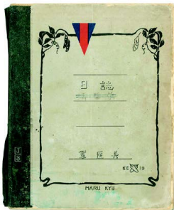
7. Journal of a chief surgeon of a submarine that joined the attack on Pearl Harbor