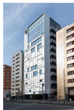
Keio Museum Commons (East Annex, Mita Campus)