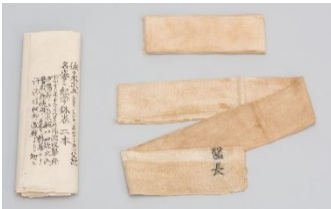
3. Hachimaki (headband) from the Attack on Pearl Harbor (Sasaki Shōgo)