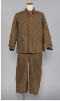
1. Military drill uniform (Yamada Daiichi)