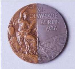
2. Medal of Friendship from the pole vault event at the Berlin Olympics (Oe Sueo)