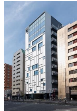
Keio Museum Commons (East Annex, Mita Campus)