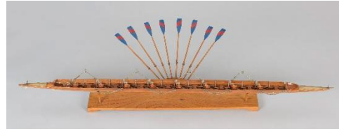
2. Model of the "KEIO" rowing boat that was used at the Melbourne 1956 Summer Olympics (Formerly owned by Yasukuni Watanabe)