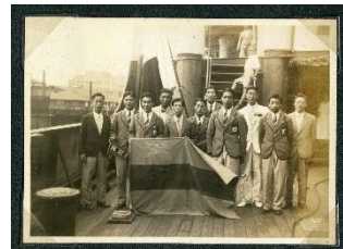
6. Members of the Keio Gymnastics Club on board a ship bound for Budapest to participate in the 1935 International University Games