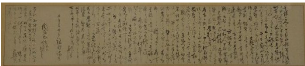
3. Correspondence from Yukichi Fukuzawa to Naruo Sekitō (Dated February 5, 1878)