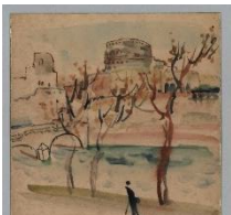
5. Avignon by Shōtarō Yasuoka (Formerly owned by Mikio Hiramatsu)