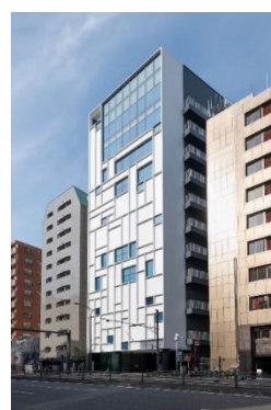
Keio Museum Commons (East Annex, Mita Campus)