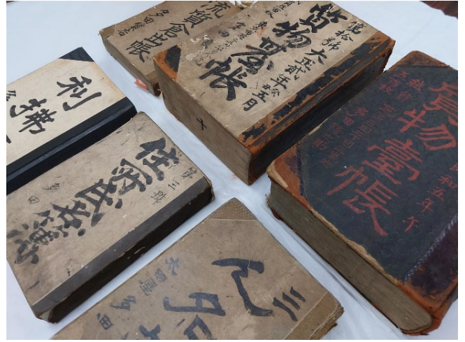
Ledgers from the Tada Pawnshop (Fukuzawa Memorial Center for Modern Japanese Studies Collection)