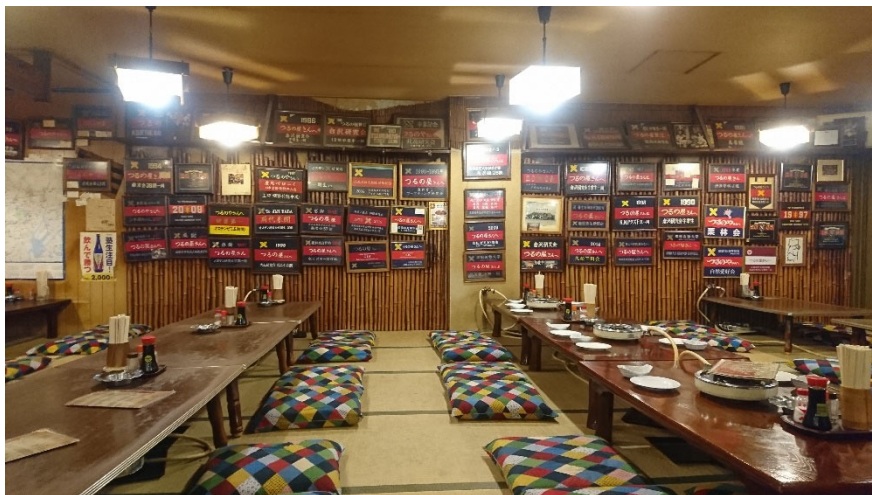
Interior of the “Tsurunoya” (2019)