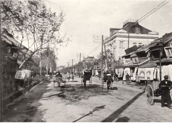
Mita Dōri at the end of the Meiji period (1868–1912)