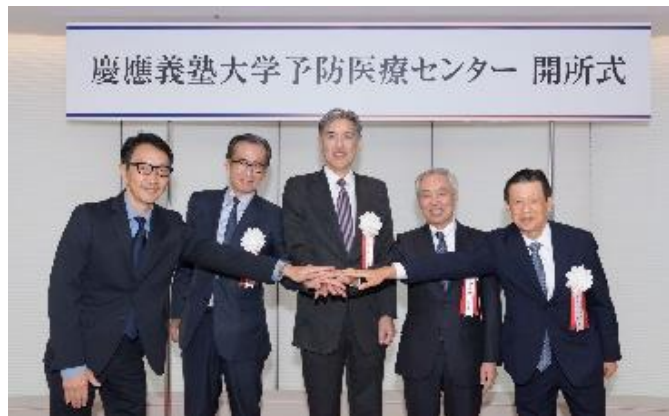
Opening Ceremony (October 4 th )