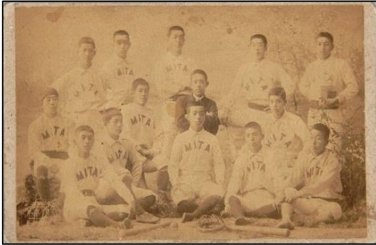
1. Photo of the Mita Baseball Club (1891)