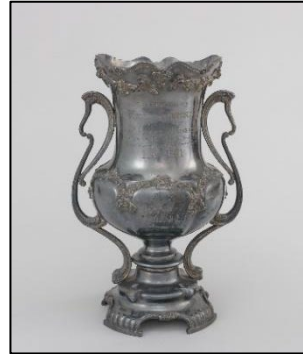
3. Trophy awarded during the club's first visit to the United States (1911)