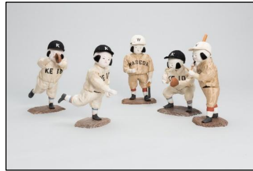
6. Japanese dolls modeled after the Keio-Waseda rivalry (c. 1930)