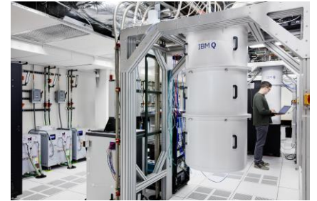
IBM Quantum Computer