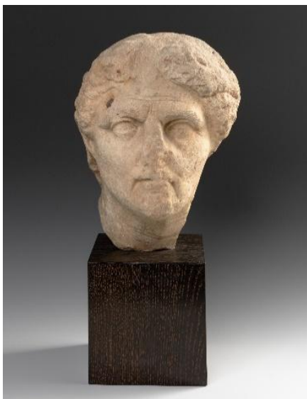
Head of a Woman , c.First century B.C.–First century A.D. ©Katsura Muramatsu (Cato works)