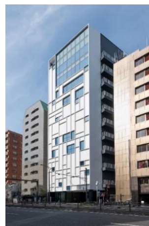
Exterior of Mita Campus East Annex