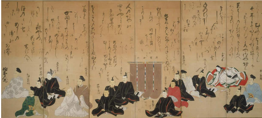
Folding Screens of the Thirty-Six Immortal Poets , calligraphy by KONOUE Nobutada, Early Edo period (17th century)

Venue : Keio University Mita Campus East Annex 3rd Floor Room 1 and 2