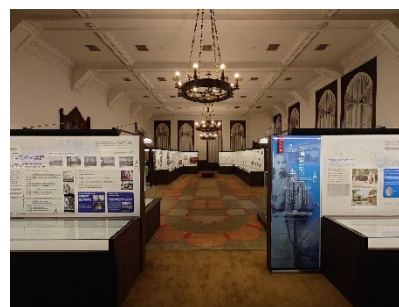
Permanent Exhibition Room of Keio History Museum

Main items exhibited at time of opening: photograph of Fukuzawa with a young girl taken at a photo studio in San Francisco; letter addressed to Fukuzawa from Katsu Kaishu (“The decision as to what to do is mine” [行蔵は我に存す]); woodblocks of works by Fukuzawa and pirated copies that prompted the institutionalization of copyrights in Japan; first record of a public speaking event in Japan; written challenge sent by Waseda University that gave rise to the tradition of Waseda-Keio baseball games; manuscripts left by students who died on the front lines; Japan's first baby stroller (Fukuzawa's souvenir from the USA); examination guidelines for the first self-recommended admission in Japan; etc.