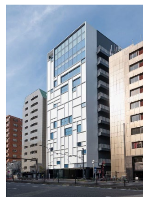
Exterior of Mita Campus East Annex

For details, please visit KeMCo’s website. http://kemco.keio.ac.jp/en/