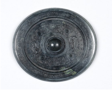
1. Mirror with Dragon, Tiger, and Deity Motif