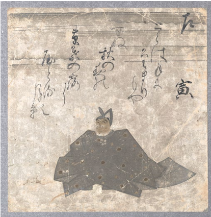
3. Album of Waka Poems by Animals of the Twelve Zodiac Signs