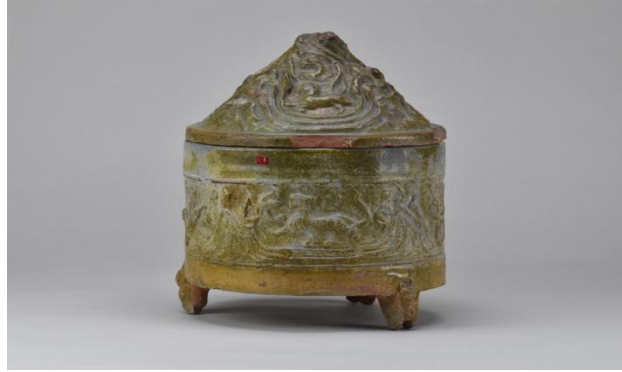
2. Green-Glazed Zun Vessel