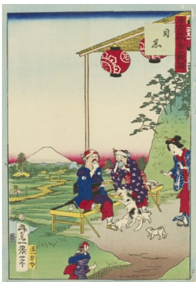
Tokyo 36 Famous Places Comic Pictures: Meguro (owned by Keio University Library)