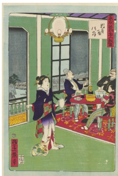
Tokyo 36 Famous Places Comic Pictures: Sukiya-gashi river bank