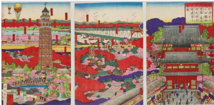
Tokyo Asakusa-Temple and Tower of Ryounkaku in the Park and Azumabashi Bridge in the Distance View