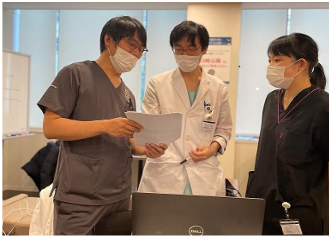
(Instruction of junior and senior residents)