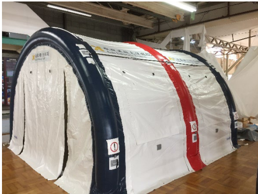
< Air tent for first aid >