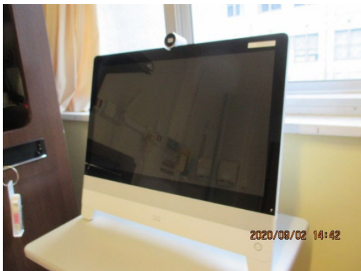
< Monitor for remote diagnosis >