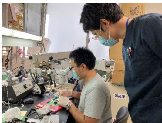
(Teaching graduate students how to generate lab mice for cardiopulmonary resuscitation)