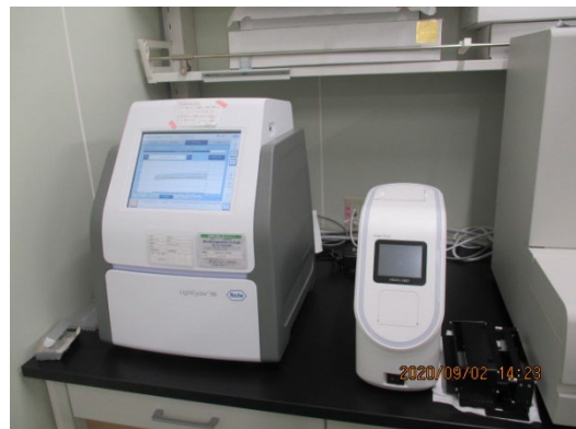
< Testing equipment for measuring COVID-19 >