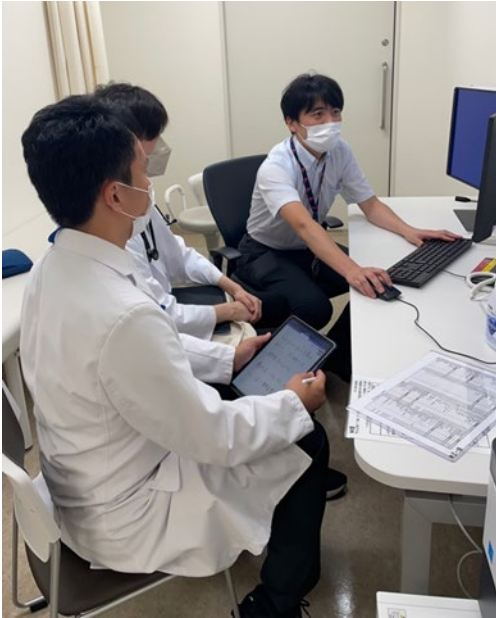
Fifth-year students receiving instruction on electronic health records (EHRs) during their clinical training