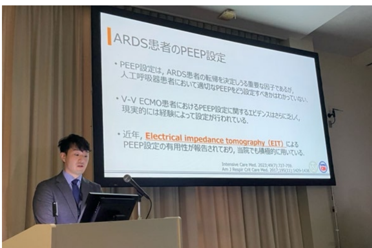
Presenting at the 52nd Annual Meeting of the Japanese Association for Acute Medicine