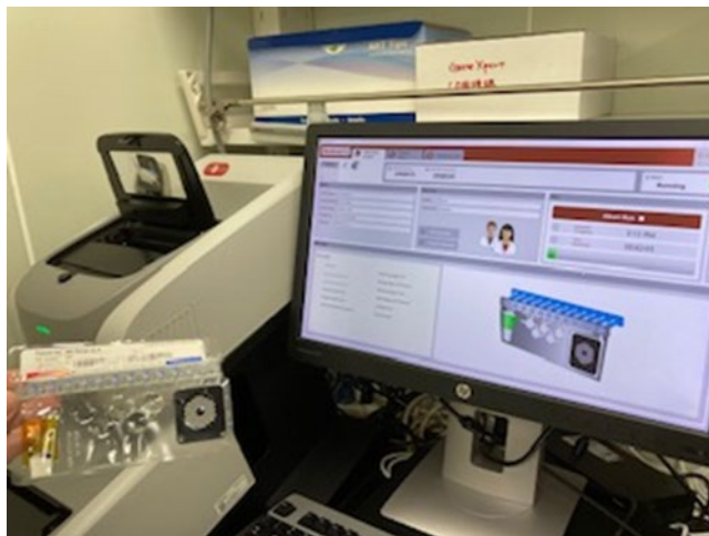
Film Array Respiratory Panel 2.1 Cepheid Xpert Xpress SARS-CoV-2

(The panel is set in the analyzer to determine a positive/negative result)