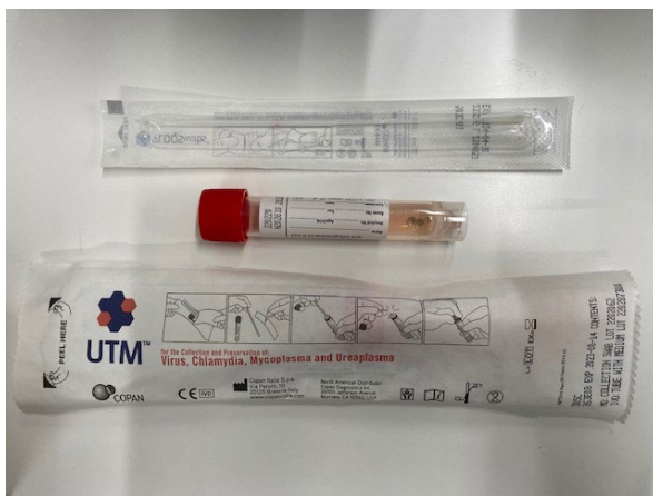
(PCR testing materials: UTM305C, FLOQ swabs, etc.)