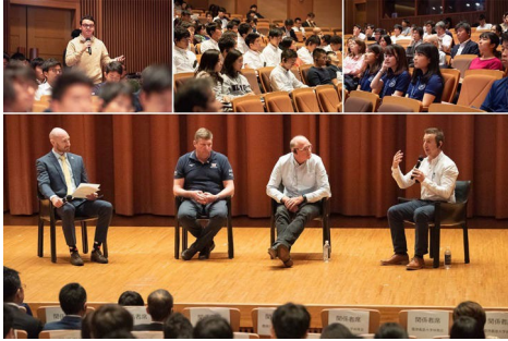
During the seminar hosted jointly with BOA (held on October 19, 2018)

https://www.keio.ac.jp/en/news/2018/Oct/24/48-49006/