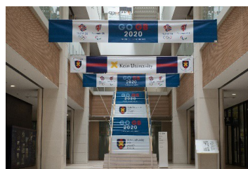
Decorations on campus with the logo (inside the Hiyoshi Campus Collaboration Complex [Kyoseikan])