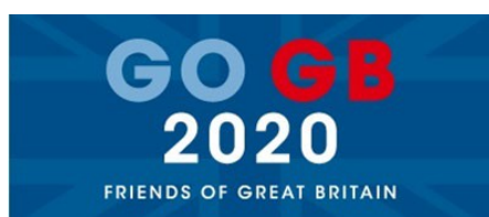
The GOGB logo, for shared use by Yokohama City, Kawasaki City, and Keio University

A branding system (joint logo, etc.) to be used jointly by Yokohama City, Kawasaki City, and Keio University was created to mutually promote and build momentum toward the hosting of the preparation camps of the British national teams. Of the design companies that participated in the proposal competition in November 2017, the company that designed Keio's 150th anniversary logo was selected as the outsourcing company and the following logo was created.