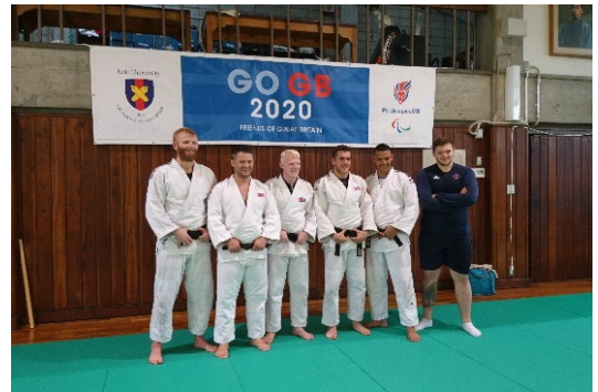
Decorations in the Judo Gymnasium

Furthermore, during the test camps, we put up decorations with GO GB logos around Hiyoshi Campus to welcome the teams and to publicize Keio University as the host of the test camps during coverage by overseas press as well as when posts were made on SNS, etc., by the athletes. During the BOA test camp in July 2019, British media outlets including the BBC, Sky Sports, and Daily Telegraph covered the teams' stay, and a member of the Keio Gymnastics and Trampoline Team was interviewed by Sky Sports.