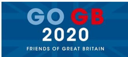
The GO GB logo, for shared use by Yokohama City, Kawasaki City, and Keio University

A branding system (joint logo, etc.) to be used jointly by Yokohama City, Kawasaki City, and Keio University was created to mutually promote and build momentum toward the hosting of the preparation camps of the British national teams. Of the design companies that participated in the proposal competition in November 2017, the company that designed Keio's 150th anniversary logo was selected as the outsourcing company and the following logo was created.