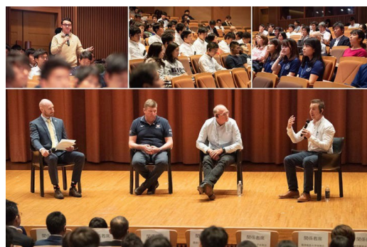
During the seminar hosted jointly with BOA

https://www.keio.ac.jp/en/news/2018/Oct/24/48-49006/