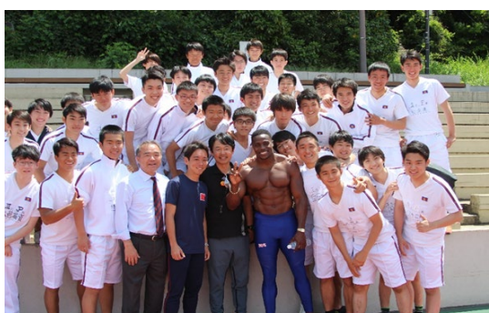
Interaction between the track and field team and Keio students

In the 2019 academic year, we had preparatory visits from the BOA and hosted test camps for Team GB athletes and staff, including those of the following teams: track and field, artistic swimming, marathon swimming, swimming, gymnastics, trampoline, judo, and taekwondo. From the BPA, preparatory visits and test camps were held by the judo, rowing, and archery teams. Some teams came to Japan on multiple occasions to ensure that they were thoroughly prepared. Furthermore, staff members of both the BOA and BPA visited several times to examine the facilities and equipment as well as to have advance meetings to discuss matters relating to the operation and coordination of the preparation camps. Students, primarily those of the Athletic Association and members of the KEIO 2020 project, provided support for the test camps and interacted with the BOA and BPA athletes.