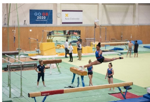
The gymnastics team practicing in the Mamushidani Gymnasium