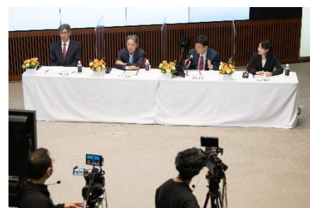
The 2022 Asahi Education Forum

In addition to this, Keio held lectures and a book fair to commemorate the 150th anniversary of An Encouragement of Learning. Keio also participated in the Asahi Education Forum held on November 13, 2022. In one particular session, “An Encouragement of Business: 150 years of an Encouragement of Learning”, they held presentations on the Fukuzawa and his students' entrepreneurial accomplishments, Keio's current efforts to promote startup creation and growth, and a panel discussion.